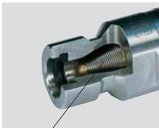
Integrated particle filter

The WEH-TN1 Receptacle works best with WEH fueling nozzles. We recommend types TK1, TK4, TK4i, TK5 CNG, TK10, TK10i, TK16 CNG and TK17 CNG.